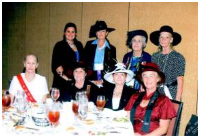
Saturday Morning District Luncheon